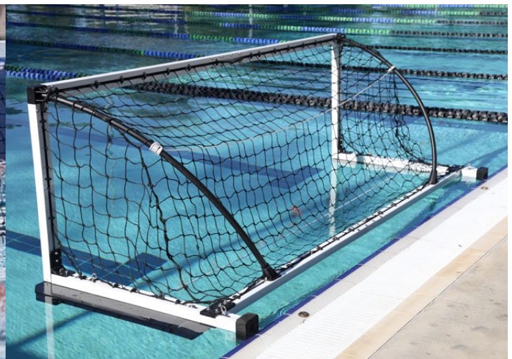
2023 USA Water Polo International Showcase Event, Irvine, USA