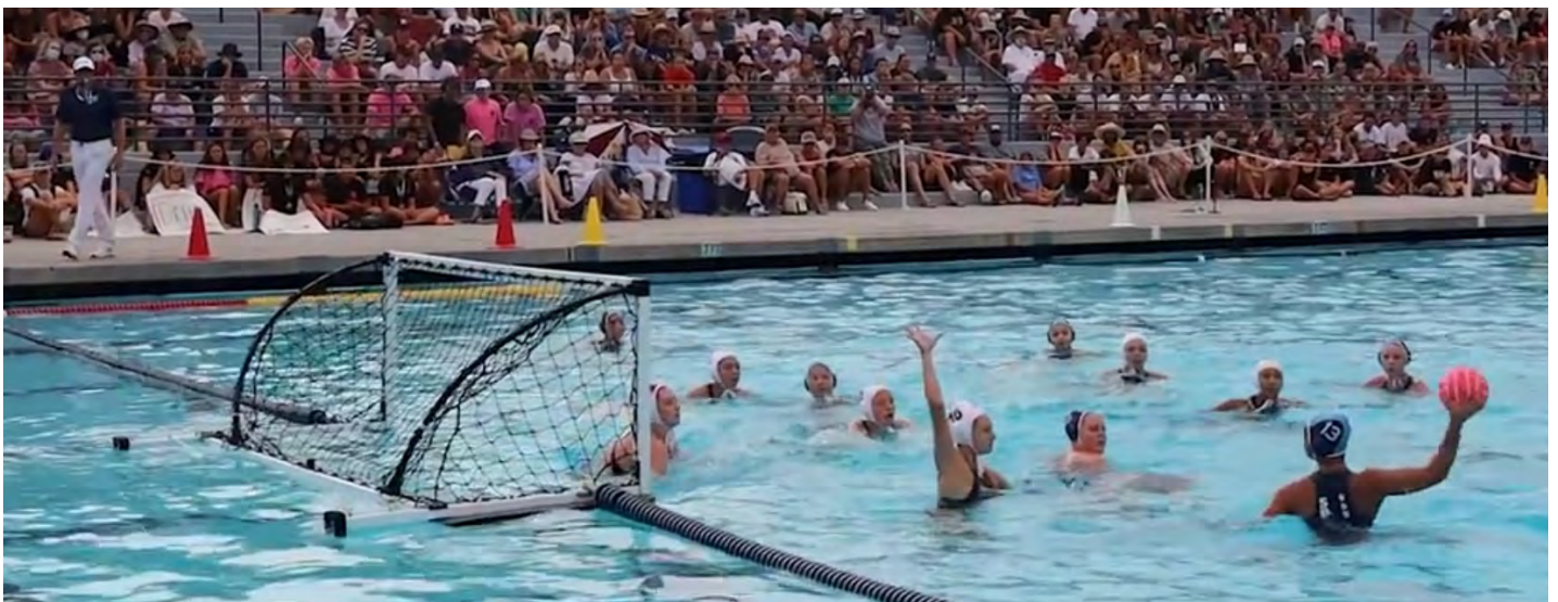
2022 USA Water Polo Finals Event, Irvine, USA