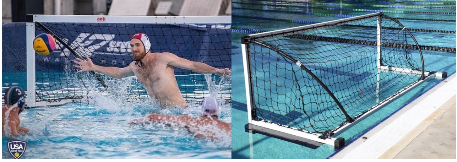
2023 USA Water Polo International Showcase Event, Irvine, USA

AWE392 SNR Global Anti Goal, ultimate durability and function